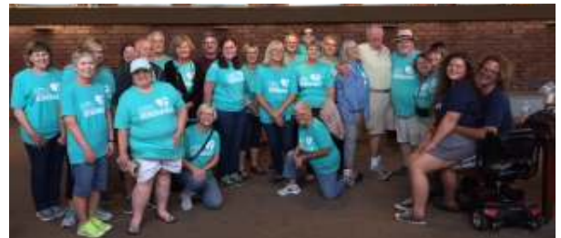
Volunteers help wrap up “Homeless Treasures” for another year, wearing their “Live Generously” T-shirts, courtesy of Thrivent Financial.

Many thanks to all who volunteered in one capacity or another, to all those who donated treasures, and to all those who came out to shop.