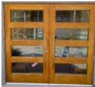
Chapel doors are being re-stained

A list of projects is posted on the kiosk in the lounge, or you may contact representatives of the Facilities Committee.