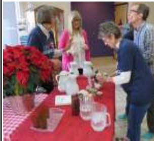
left: Enjoying food samples right: learning about non-profit organizations