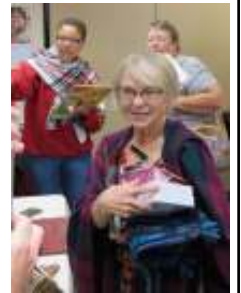
below: Finding Fair Trade goodies!